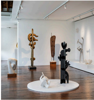
Installation view, Against Time: The Noguchi Museum 40th Anniversary Reinstallation .