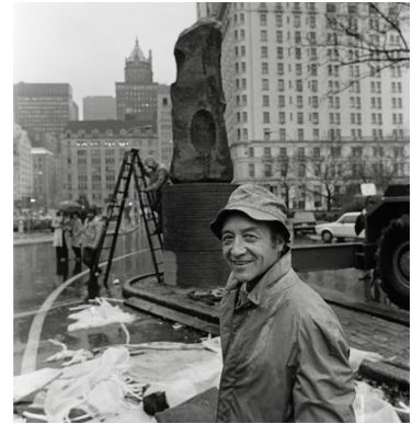
Isamu Noguchi at the debut of Unidentified Object , New York, 1979.

Curated by Matthew Kirsch, this exhibition offers a dynamic, cross-temporal conversation between Ogunbiyi's contemporary work and Noguchi's legacy, emphasizing art's potential to connect people and inspire collective reflection.