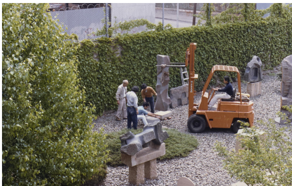
Isamu Noguchi, Masatoshi Izumi, and crew working on the garden of the Isamu Noguchi Garden Museum, 1985. The Noguchi Museum Archives, 13119. ©INFGM/ARS