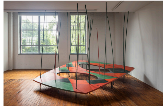
Isamu Noguchi, Dance Platform for Martha Graham's Embattled Garden , 1958. Paint, canvas, wood, rattan rods.

marble (along with later bronze reproductions), experiments with lit elements concealed within molded magnesite which Noguchi called Lunars, and carved onyx and alabaster works. An array of Noguchi's project models, rarely shown as a group, will include unrealized designs for monuments and memorials, and formative playground concepts with later models of realized indoor and outdoor environments. These will be paired with set elements from three of Noguchi's enduring and transformative collaborations with the choreographer Martha Graham, illustrating how these exercises in the partitioning and punctuation of space expanded outward.