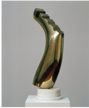
Isamu Noguchi, Foot Tree , 1928. Brass. 24 1/8 x 12 1/2 x 6 7/8 in. (61.3 x 31.8 x 17.5 cm). Photo: Kevin Noble. © The Isamu Noguchi Foundation and Garden Museum, New York / Artists Rights Society (ARS)