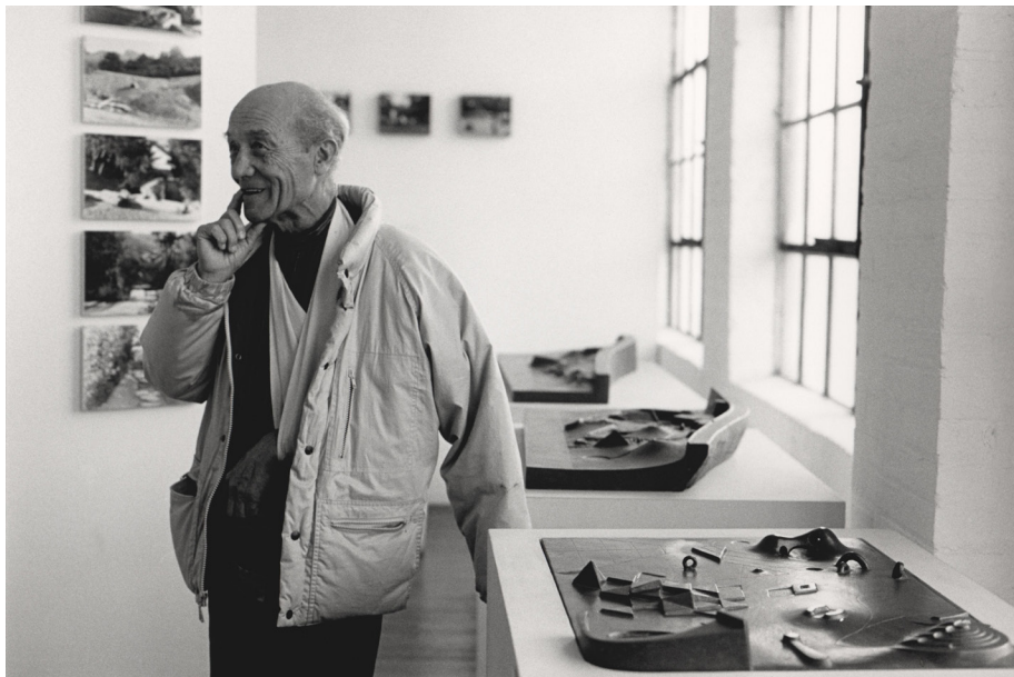
Isamu Noguchi gives a tour of The Isamu Noguchi Garden Museum in 1988.

Against Time presents a reinstallation of Isamu Noguchi's sculptures and project models from the permanent collection August 28, 2024 – January 11, 2026