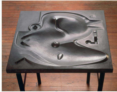
Isamu Noguchi, Contoured Playground , 1941 (cast 1963). Bronze. 2 3/4 x 26 1/4 x 26 1/4 in. (7 x 66.7 x 66.7 cm).