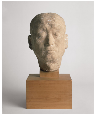
Isamu Noguchi, Uncle Takagi (Portrait of My Uncle) , 1931. Terra-cotta. 12 3/8 x 8 3/4 x 8 1/2 in. (31.4 x 22.2 x 21.6 cm). Photo: Kevin Noble. © The Isamu Noguchi Foundation and Garden Museum, New York / Artists Rights Society (ARS)