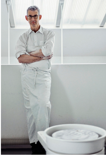
Edmund de Waal.