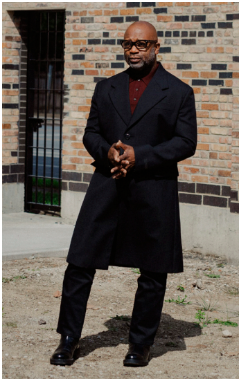
Theaster Gates.

"I'm truly honored to be receiving the Isamu Noguchi Award. Noguchi has been a constant presence in my life since I first went to Japan over forty years ago," says Edmund de Waal. "I was a pilgrim to the many places in which he worked and since then feel that I have traveled in his footsteps. His relationship with the materials of clay and stone and his sense of place have informed and delighted me. Noguchi's encounters with traditional skills were respectful: he took them seriously enough to change and renew them with vigor. I am a potter, I work with the oldest craft in the world and I try to renew my art in a similar way."