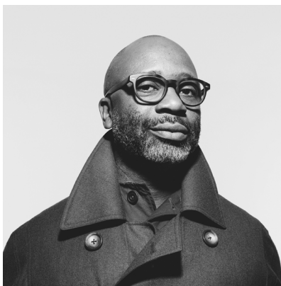
Theaster Gates.