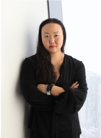
Hanya Yanagihara.

Hanya Yanagihara is an American, New York-based novelist, editor, and writer. The author of three novels, Yanagihara's work tackles topics that are complicated at times, dealing with reckonings that make us human. Her writing is suffused with rich descriptions that showcase her curiosity for culture. In her current role as the longstanding editor in chief of T: The New York Times Style Magazine , Yanagihara has produced prolific issues rooted in global perspectives of art history, fashion, design, craft, and travel. Echoing Noguchi – who believed in the power of the written word and continuously returned to his travels and particular places in time for inspiration and guidance – Yanagihara's work reflects a kaleidoscopic perspective.