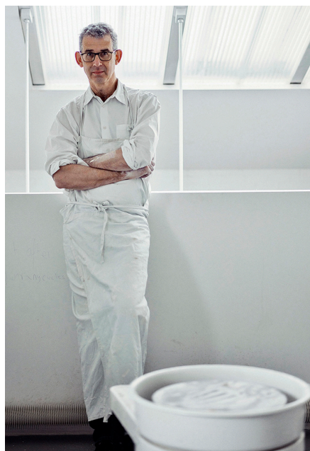
Edmund de Waal.

The Award celebrates individuals from around the world, across various disciplines, whose works demonstrate the highest level of artistic integrity marked by fearless experimentation and a preoccupation with cross-cultural dialogue and exchange. Honoring individuals whose work exhibits qualities of artistic excellence that are shared with Noguchi, the Award also recognizes work that carries significant social consciousness and function.