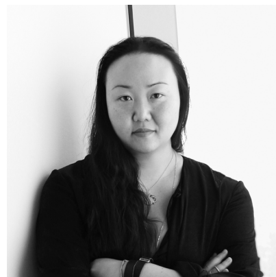
Hanya Yanagihara.

New York (June 6, 2023) – The Isamu Noguchi Foundation and Garden Museum —the first museum in the United States to be established, designed, and installed by a living artist to show their own work—is pleased to celebrate the 10th anniversary of its annual Isamu Noguchi Award . Established in 2014 to honor the tenets Isamu Noguchi exemplified in his life's work, the Award will recognize Edmund de Waal, Theaster Gates, and Hanya Yanagihara . The Award will be presented at the Museum's annual benefit gala on Tuesday, September 12, 2023 , at The Noguchi Museum in Long Island City .