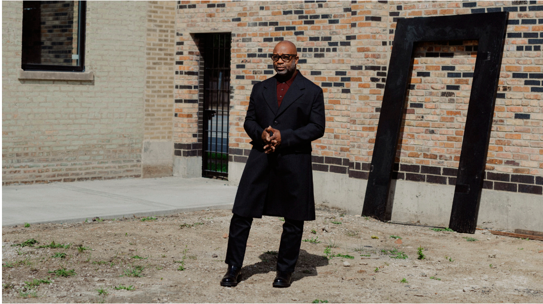
Theaster Gates.

Noguchi’s practice continue to act as pillars and anchors of truth for me. I am humbled to receive this recognition and to be recognized amongst my colleagues Hanya Yanagihara and Edmund de Waal.”