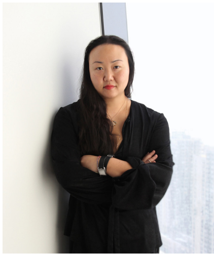
Hanya Yanagihara.

Noguchi’s practice continue to act as pillars and anchors of truth for me. I am humbled to receive this recognition and to be recognized amongst my colleagues Hanya Yanagihara and Edmund de Waal.”