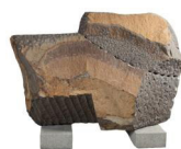
Give and Take 1984 Basalt ⌀1071