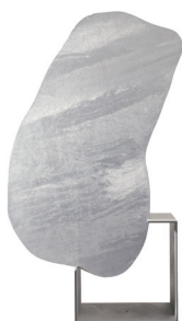
Magritte's Stone 1982–83 Hot-dipped galvanized steel P1038

This ground level space was once Noguchi's garage, where he parked his beige Volkswagen Rabbit. When the Museum was renovated in 2002–04 to add the basic amenities required to open year-round, the floor in this gallery was raised, and the picture window, stairs, and ramp above were added.