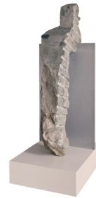
Green Essence 1966 Serpentine, aluminum P 594