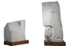
Euripides 1966 Italian marble P592