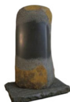
The Stone Within 1982 Basalt ⌀999