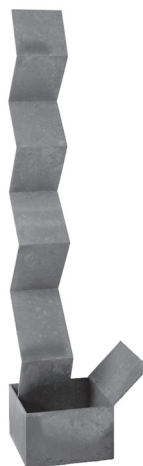
Jack in the Box 1984 Hot-dipped galvanized steel P1049