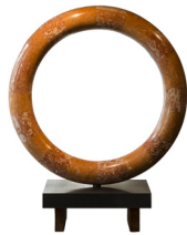
Sun at Noon 1969 French red marble, Spanish Alicante marble P 664