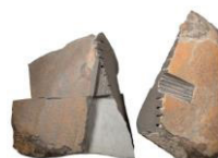
Mountain Breaking Theater 1984 Basalt ⌀1076