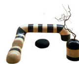
Floor Frame (Remembering India) 1970 Yellow Sienna marble, black Petit Granite P680