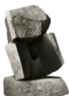
Woman 1983–85 Basalt ⌀1118