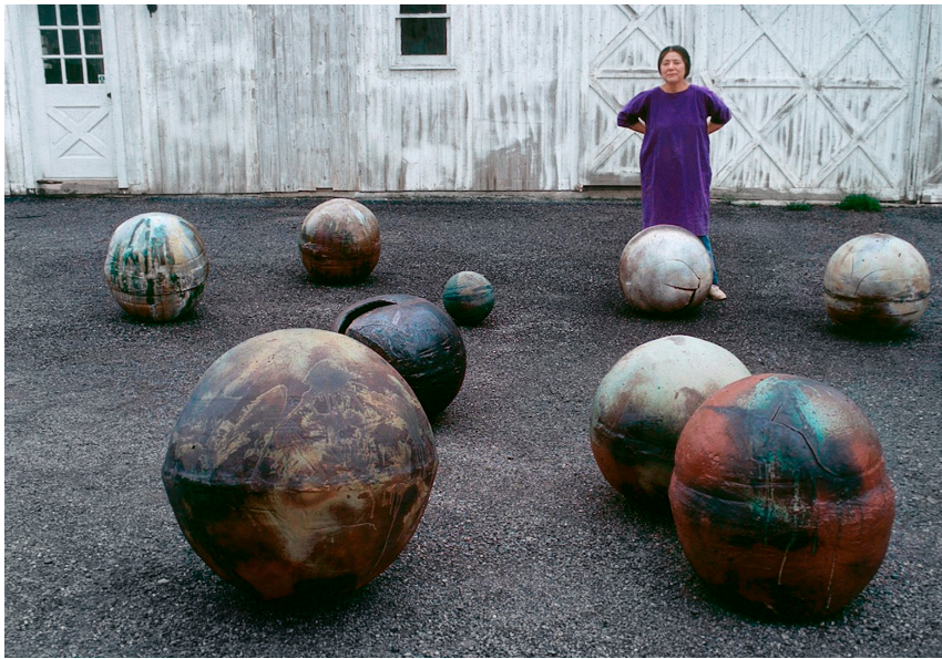
Toshiko Takaezu with moons, 1979.

“On a personal note, I grew up in Hawai‘i hearing about Isamu Noguchi, and I know my great aunt would be so pleased that her work will be presented in the museum he founded and designed. It is particularly symbolic to announce this project on what would have been her 100th birthday. It is so meaningful to be able to do her legacy justice on such a significant milestone.”