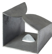
Secret 1982-83 Hot-dipped galvanized steel ø1047