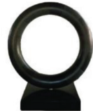
Sun at Midnight 1973 Granite P730