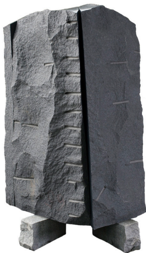
End Pieces 1974 Swedish granite ø737

The installation in Area 8, a space that was once a garage where Noguchi parked his beige Volkswagen Rabbit, is an extension of the exhibition Noguchi: Useless Architecture (on view through May 8, 2022). The centerpiece of the installation is End Pieces (1974), a closed house of cards made from four waste slabs of the granite from which Noguchi made many sculptures. It has been temporarily relocated from Area 2 (Garden).