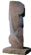
Venus 1980 Manazuru granite P940