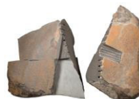
Mountain Breaking Theater 1984 Basalt P1076