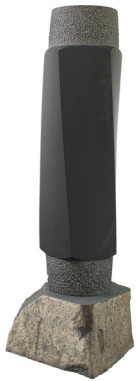
Entasis of a Pentagonal Helix 1984 Basalt Ø1109

Isamu Noguchi, The Isamu Noguchi Garden Museum (New York: Harry N. Abrams, Inc., 1987).