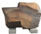
Give and Take 1984 Basalt P1071