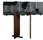
End Piece 1974 Basalt, corten steel P736