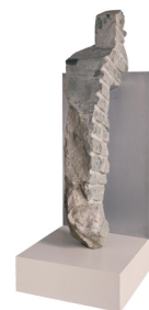
Green Essence 1966 Serpentinite, aluminum P 594