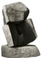
Woman 1983-85 Basalt P1118