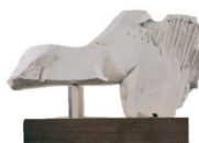
The Roar 1966 Arni marble P602