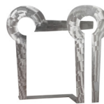
Sentinel 1973 Stainless steel P729