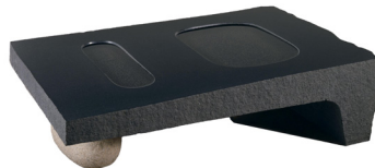
Water Table 1968 Granite, natural granite stone, water Ø645