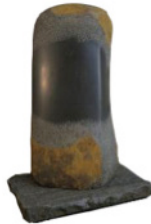
The Stone Within 1982 Basalt P999