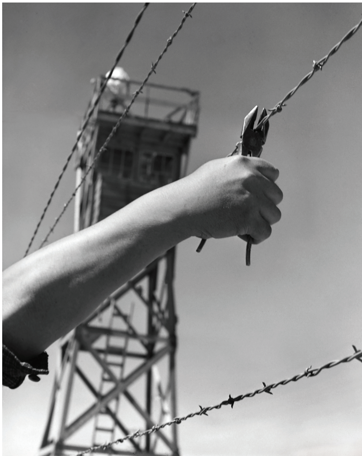
Toyo Miyatake, Untitled (Opening Image from Valediction) , 1944. Gelatin silver print. 13 3 / 4 x 10 3 / 4 in.