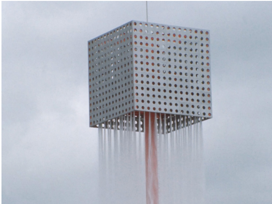
Unedited silent 16mm footage of Isamu Noguchi's fountains in action at Expo '70, Osaka, Japan. Arnold Eagle, c. 1970. The Noguchi Museum Archives, AV_F16_032_c1970. © The Isamu Noguchi Foundation and Garden Museum / ARS

Newly digitized film, video, and audio recordings from Isamu Noguchi's lifetime are now available to browse in the artist's digital archive