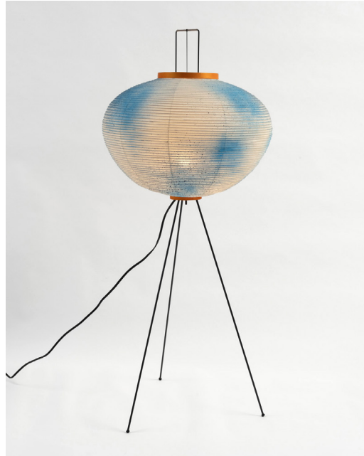
Isamu Noguchi / FUTURA2000, Hand-painted Akari 10A