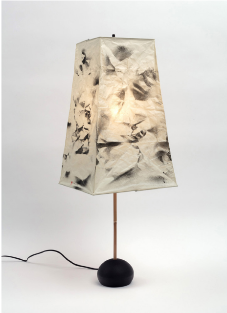
Isamu Noguchi / FUTURA2000, Hand-painted Akari BB2-V1