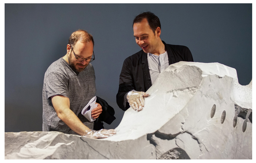
Touch Tours for visitors who are blind or partially sighted at The Noguchi Museum. Photo: Katherine Abbott. ©The Isamu Noguchi Foundation and Garden Museum / Artists Rights Society

MEDIA CONTACT Noguchi Museum Press Office: communications@noguchi.org