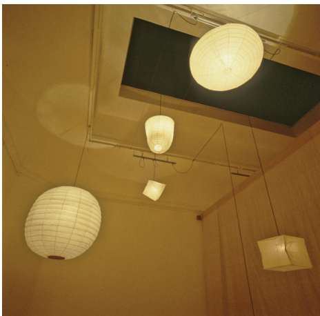
Isamu Noguchi: What is Sculpture? Venice Biennale, 1986.

In the classroom activities section of this guide, you will find an activity that invites students to debate the question of whether Akari are examples of art or design. This section will give you background on this decades-long discussion.