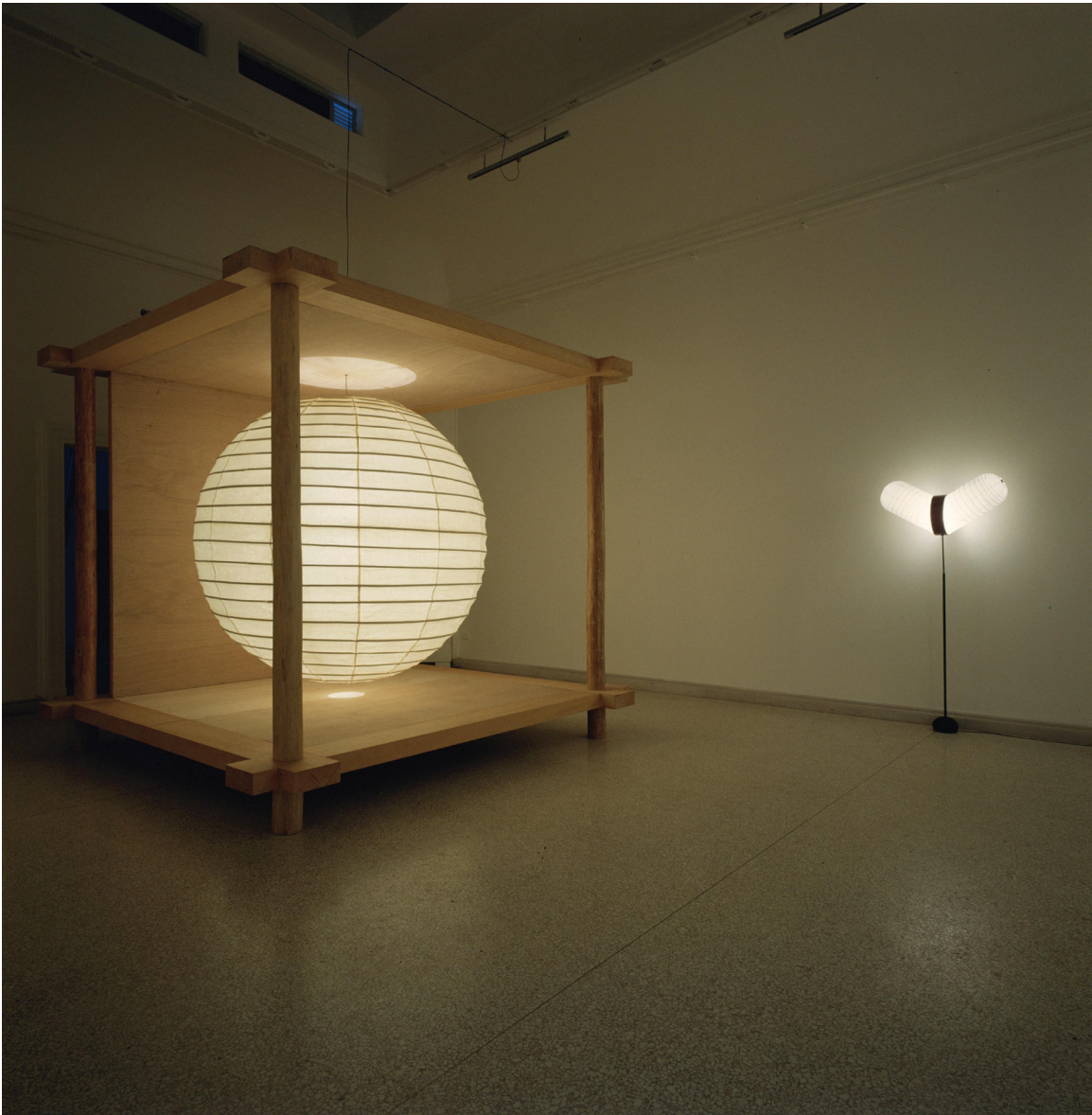
Isamu Noguchi: What is Sculpture? , 1986 Venice Biennale June 29, 1986–September 28, 1986.