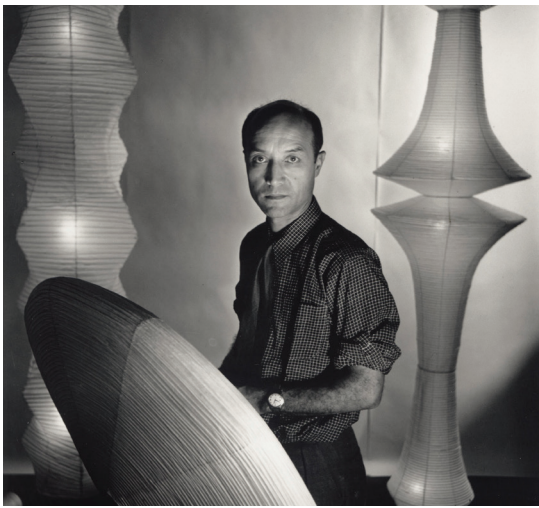
Portrait of Isamu Noguchi, 1955.

This introduction to Isamu Noguchi and his Akari project can be read to students. Visit The Noguchi Museum website if you wish for a more in-depth biography , chronology , or akari history .