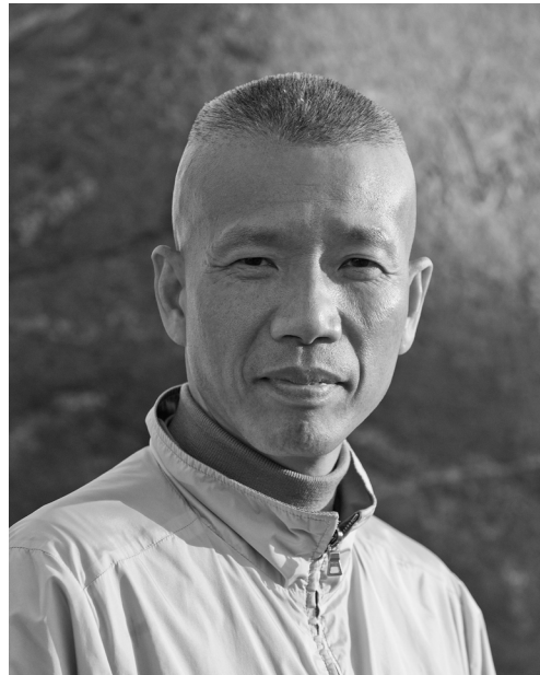
Cai Guo-Qiang.

New York, NY (November 13, 2020) – The Noguchi Museum will present the 2020 Isamu Noguchi Award to architect Sir David Adjaye OBE and artist Cai Guo-Qiang in a virtual celebration on Monday, November 16, 2020, at 8 pm EST. In its seventh year, the Isamu Noguchi Award is conferred on individuals who share Noguchi's spirit of innovation, global consciousness, and commitment to Eastern and Western cultural exchange. Event supporters giving any donation amount will receive access to the virtual event. Details and registration: noguchi.org/benefit .