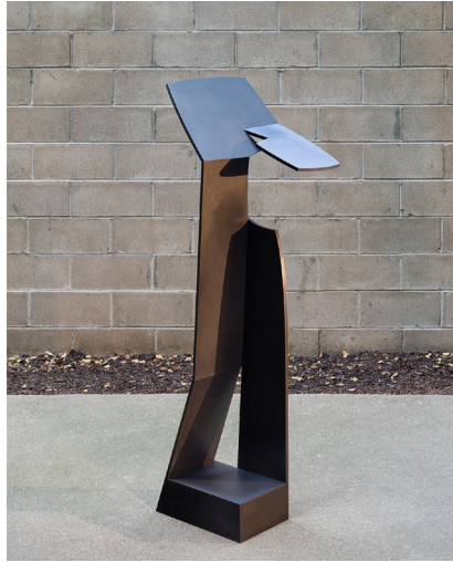
L: Isamu Noguchi, Linga , 1987 (fabricated 1988). Muntz metal Unique AP Starting bid: $125,000