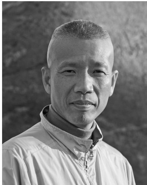
Cai Guo-Qiang.