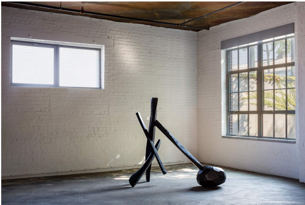
Isamu Noguchi, Victim (1962, cast 1984) in Area 4 of The Noguchi Museum.

Free admission October 21–25 sponsored by Bloomberg Philanthropies