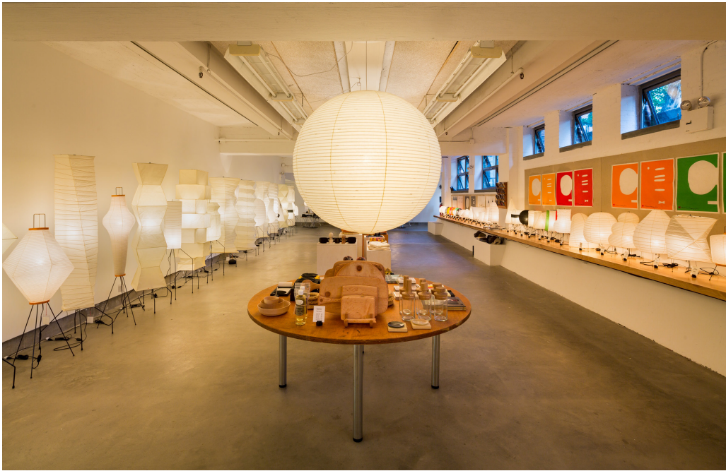
The Noguchi Museum Shop.