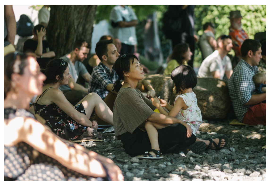
The Bang on a Can music series, now in its ninth year at The Noguchi Museum, continues with monthly performances in the Museum's celebrated outdoor sculpture garden (or indoors in inclement weather).