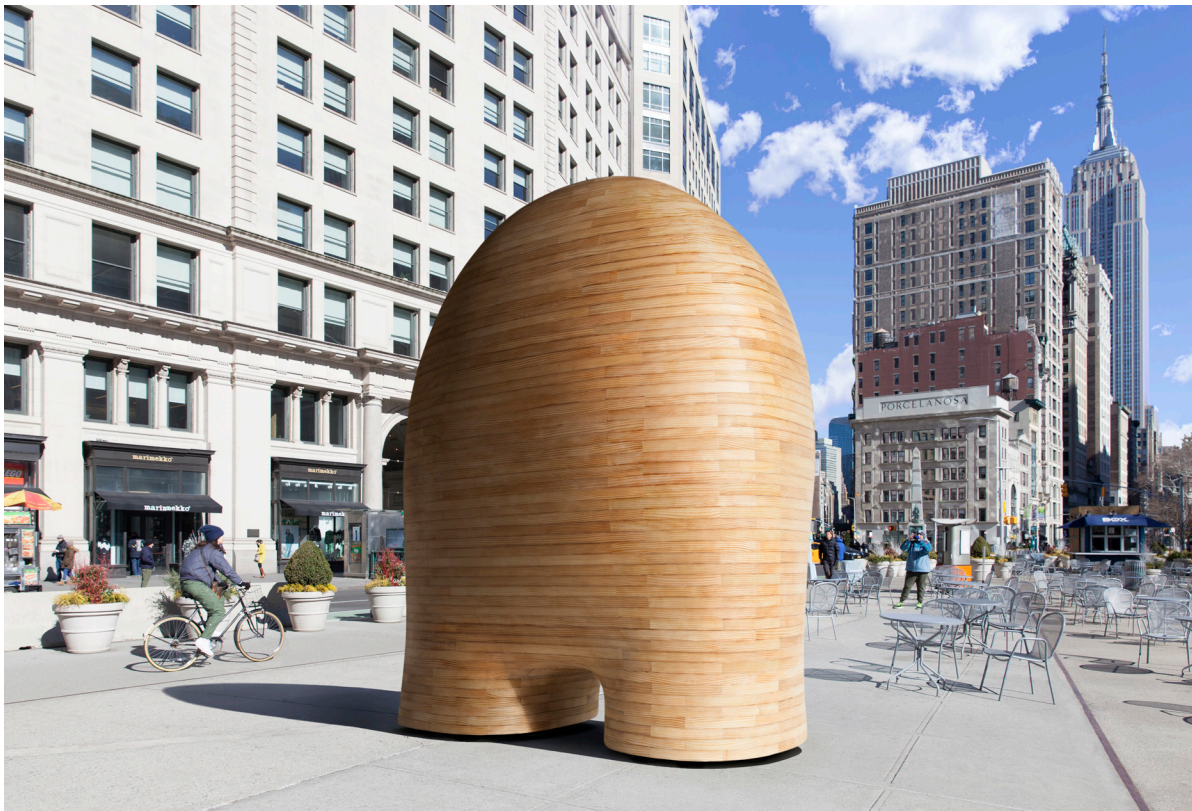
Jorge Palacios, Link , 2018. Accoya. Photomontage ©Jorge Palacios.